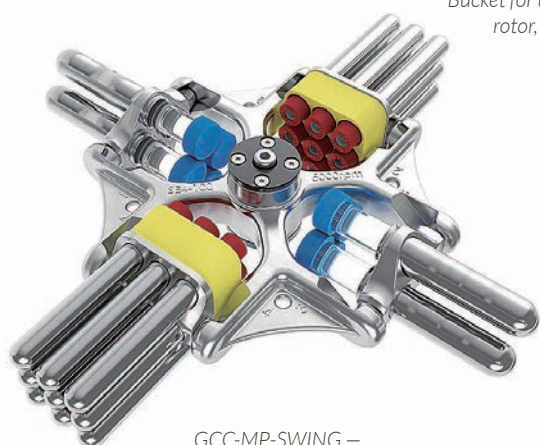
GCC-MP-SWING – Aluminum alloy swing-out rotor, 4-place for buckets (buckets / tube adapters sold separately)