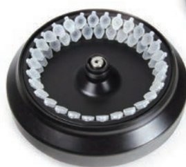
GCC-MP-2ML30 – Aluminum alloy rotor with lid, fixing clips and o-ring, 30-place for 1.5mL and 2.0mL microcentrifuge tubes