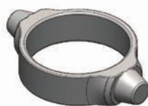
GCC-MP-SWING-100ML4 – Bucket for use with GCC-MP-SWING rotor, for 4 x 100mL tubes