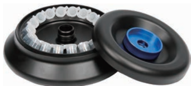
GCC-MP-5ML – Aluminum alloy rotor with lid, fixing clips and o-ring, 18-place for 5mL conical bottom tubes