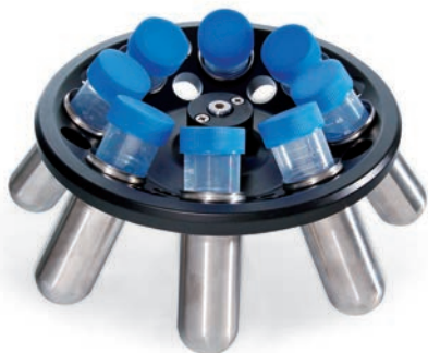
GCC-MP-50ML8 – Aluminum alloy rotor, 8-place for 50mL centrifuge tubes