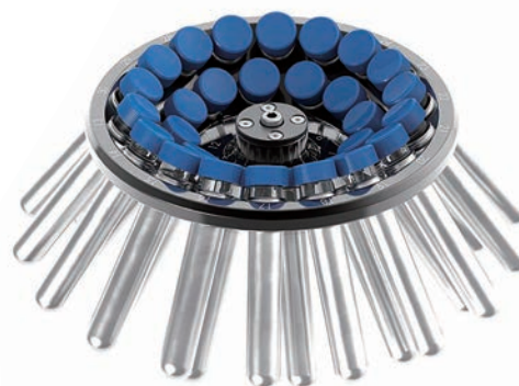
GCC-MP-15ML – Aluminum alloy rotor, 30-place for 15mL centrifuge tubes