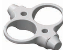
GCC-MP-SWING-50ML8 – Buckets for use with GCC-MP-SWING rotor, for 8 x 50mL tubes