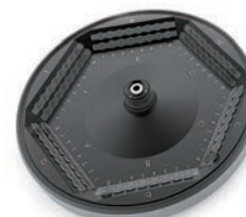
GCC-MP-PCR – Aluminum alloy rotor with lid, fixing clips and o-ring, 12-place for 0.2mL 8 position PCR strip