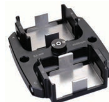
GCC-MP-SWING-PLATE – Aluminum alloy swing-out rotor for microplates (2-place)