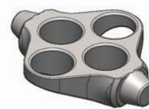
GCC-MP-SWING-15ML16 – Buckets for use with GCC-MP-SWING rotor, for 16 x 10mL, 12mL and 15mL tubes