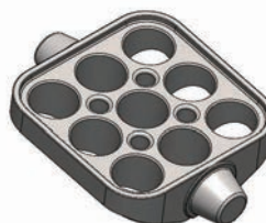
GCC-MP-SWING-7ML36 – Buckets for use with GCC-MP-SWING rotor, for 36 x 3mL and 7mL tubes